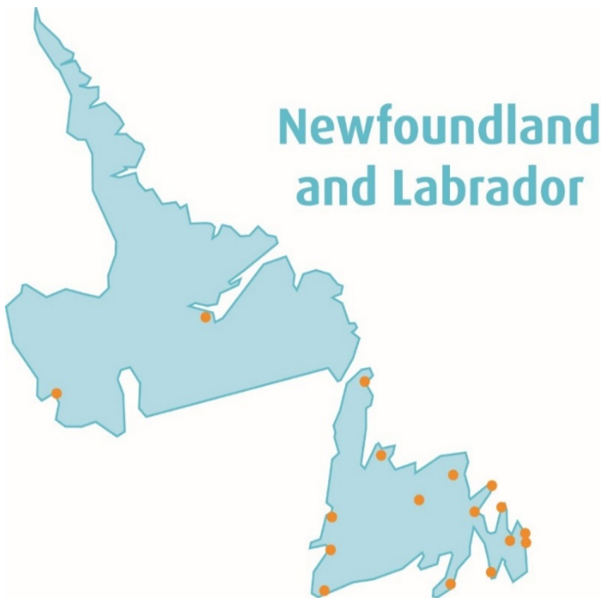
Map of Newfoundland and Labrador with location of 17 campuses noted.

Baie Verte Bay St. George Bonavista Burin Carbonear Clarenville Corner Brook Gander Grand Falls-Windsor Happy Valley-Goose Bay Labrador West Placentia Port aux Basques Prince Philip Drive- St. John’s Ridge Road- St. John’s Seal Cove St. Anthony