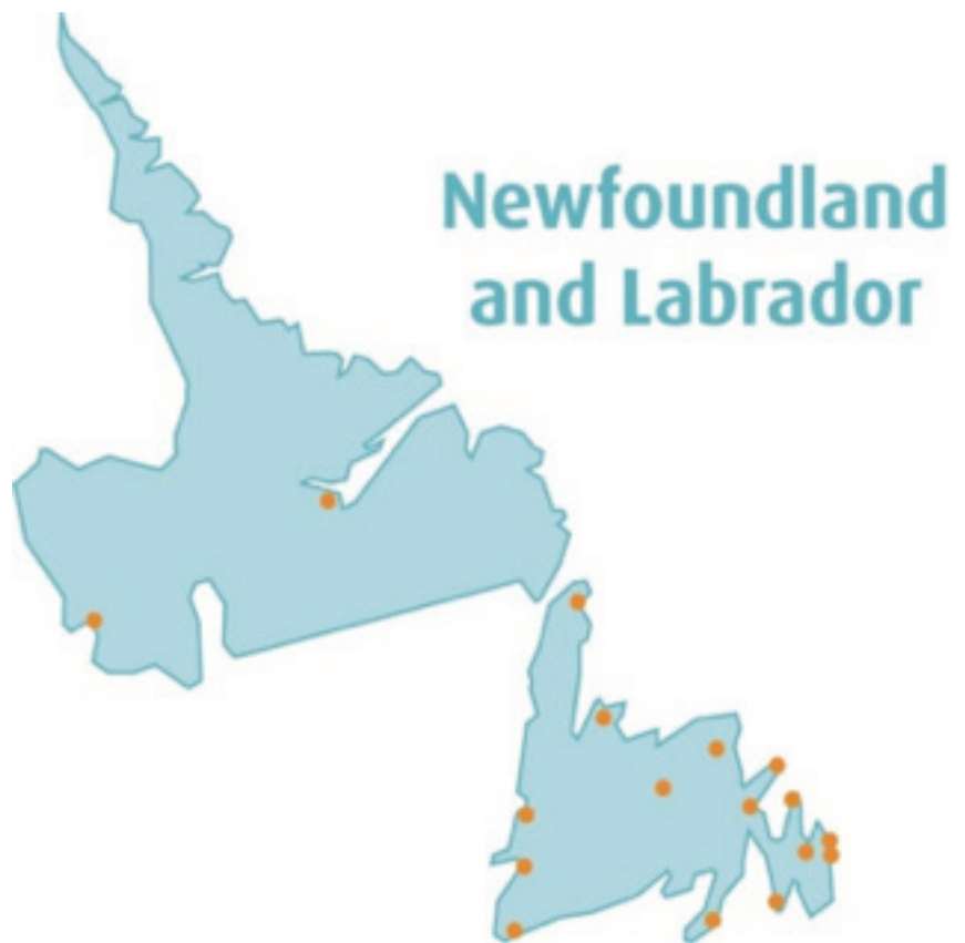
Map of Newfoundland and Labrador with location of 17 campuses noted.

Baie Verte Bay St. George Bonavista Burin Carbonear Clarenville Corner Brook Gander Grand Falls-Windsor Happy Valley-Goose Bay Labrador West Placentia Port aux Basques Prince Philip Drive - St. John’s Ridge Road - St. John’s Seal Cove St. Anthony