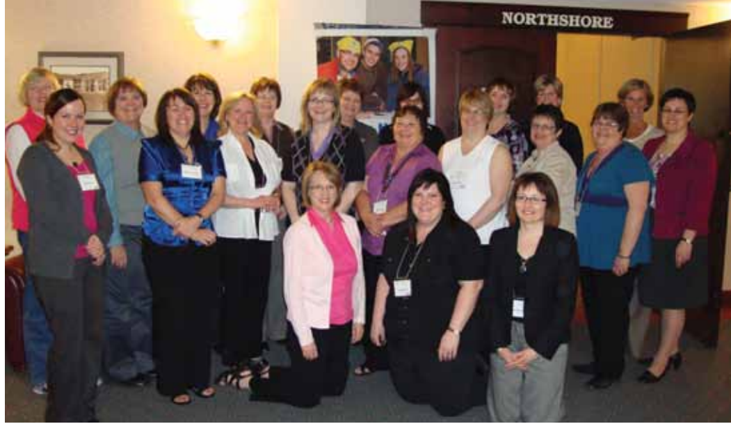
The provincial Office Administration Curriculum Team recently held its annual conference (May 11-13) at the Greenwood Inn & Suites in Corner Brook.

The team members have come to look forward to this time together, and everyone goes away from the conference with renewed enthusiasm for their learners and for their craft. The meeting provided networking and discussion opportunities with others who are teaching within the same program and the same courses, and there is something to be said for putting faces to the names of those you work with via telephone and email all year. You can't even imagine the amount of work a group of 22 Office Administration instructors can accomplish!