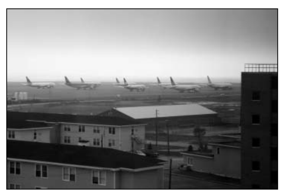
Eight planes landed in Stephenville, rerouted from their American and Mexican destinations. This was the view from Headquarters/Bay St. Georges Campus.