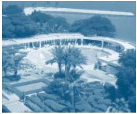
L to R: Children cool off during a day trip to the Sea Line Resort in Doha; Camels are a common site in Qatar; Tropical view from the Sheraton Hotel; Opposite page: People buy their everyday items and even have their hair cut in the Doha markets called Souqs.